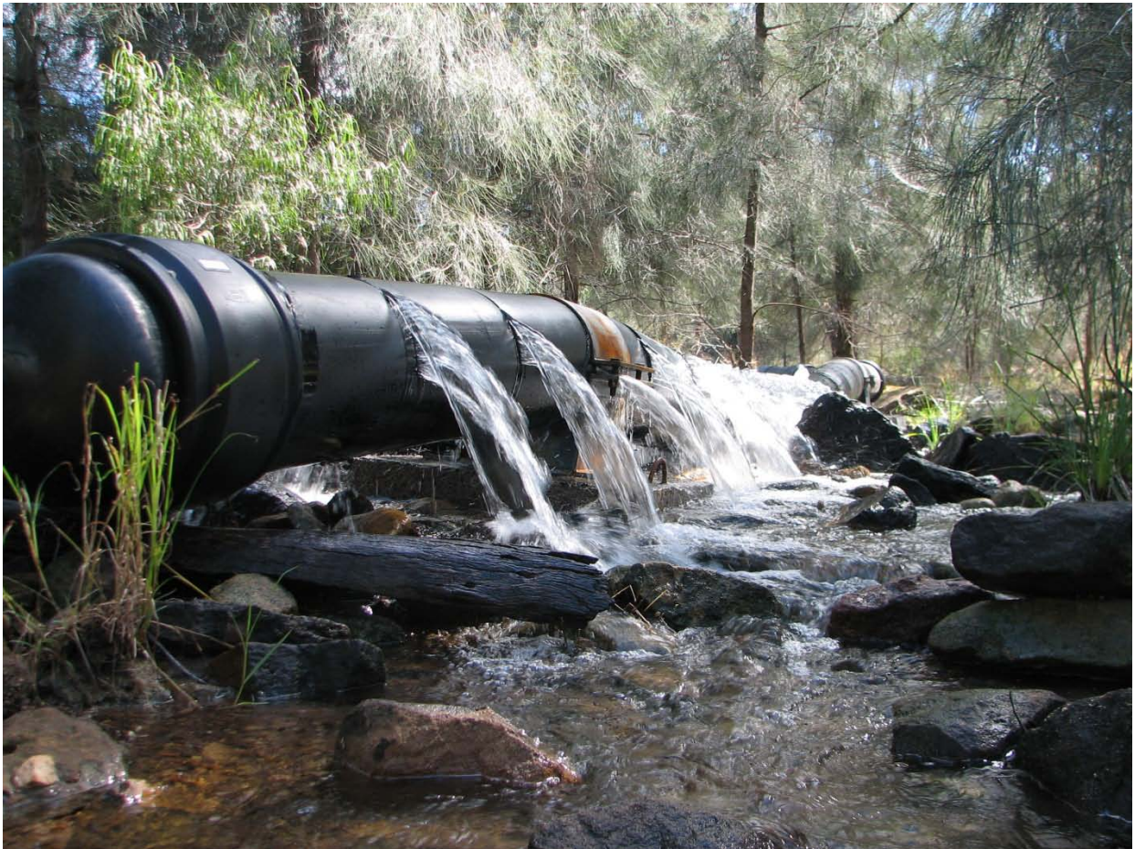
Figure 1 - SGWTF Discharge Location

To ensure the safety and reliability of the treated CSG water entering possible sources of drinking water, Australia Pacific LNG undertook a comprehensive monitoring program of water quality sampling, testing and reporting. This report summarises the results of that monitoring conducted during the third quarter (i.e. from 1 July to 30 September) Year 2011.