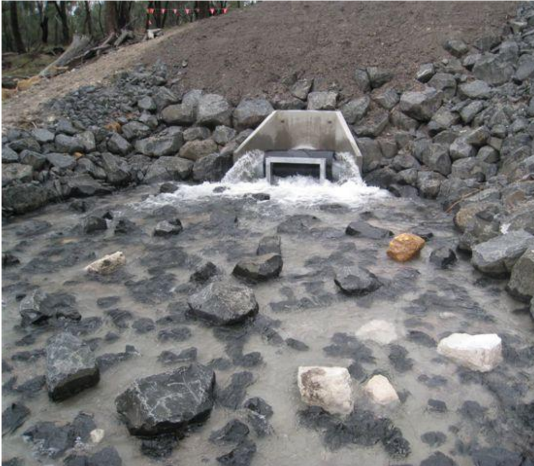
Figure 1 - TWTF Discharge Location

To ensure the safety and reliability of the treated CSG water entering the River, Australia Pacific LNG is engaged in a comprehensive ongoing monitoring program of water quality sampling, testing and reporting. This report summarises the results of that monitoring conducted during the fourth quarter (i.e. from 1 October to 31 December) Year 2011.