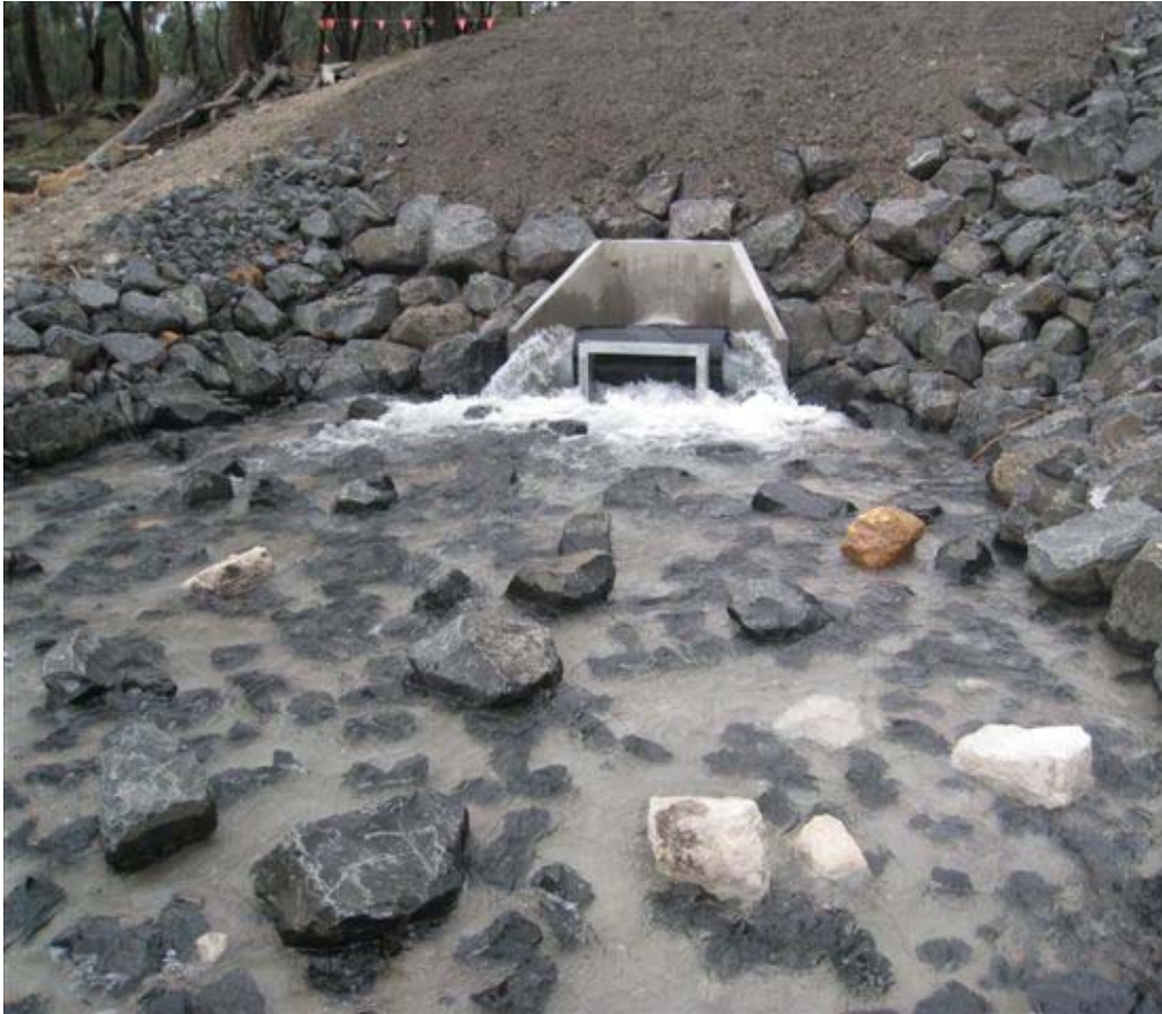
Figure 1 - TWTf Discharge Location

To ensure the safety and reliability of the treated CSG water entering the river, Australia Pacific LNG is engaged in a comprehensive ongoing monitoring program of water quality sampling, testing and reporting. This report summarises the results of that monitoring conducted during the third quarter (i.e. from 1 July to 30 September) of the Year 2012.